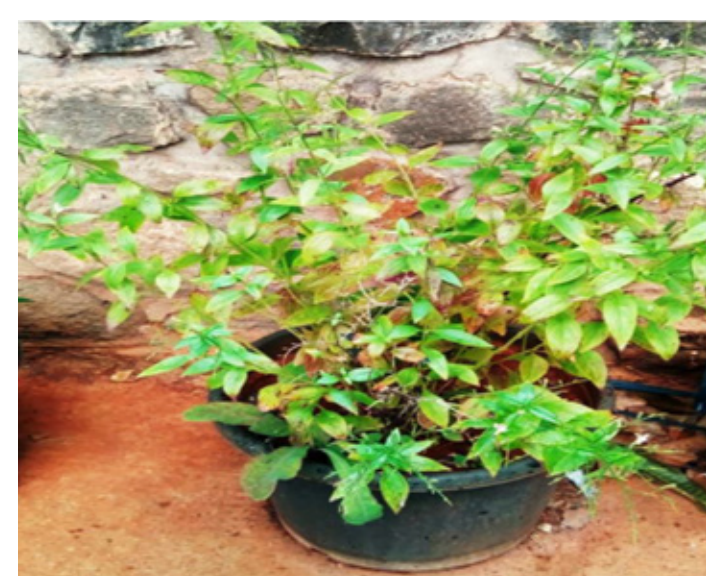
Figure 1: Andrographis paniculata (Acanthaceae).

In order to evaluation of possible crystallization, the oxymel was placed in refrigerator for a period of a week and then examined for precipitation.