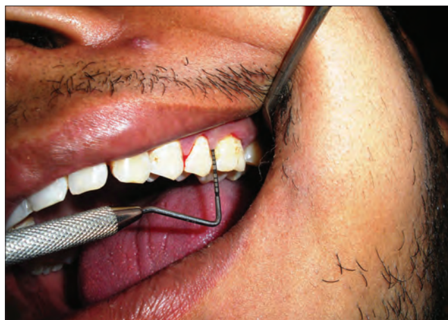
Figure 2: Measurement of probing depth at baseline

Group A was treated with SRP + MET and Group B with SRP alone. At the end of the observation interval (i.e. 15 th and 30 th day), all sites got healed unevenly. The mean values for PD, PI, and GI score were measured at 15 th and 30 th days following treatment. The percentage reduction in PD, PI, and GI scores from baseline was 68%, 85%, and 90%, respectively, in the patients treated with