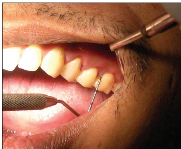
Figure 4: Measurement of probing depth after 1 month

SRP + MET (Group A), whereas in the patients treated SRP alone (Group B), the values were about 50%, 71%, and 71%, respectively, which shows that the formulation containing MET was significantly better.