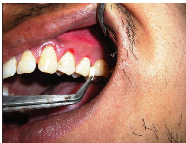
Figure 3: Insertion of the nanofiber into the pocket