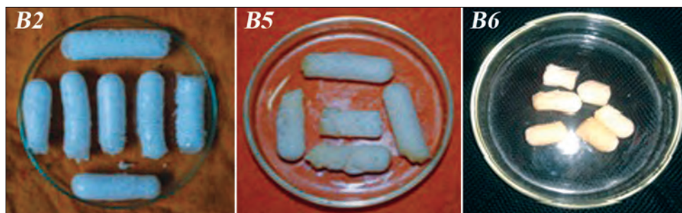
Figure 1: Photograph of petridishes (inner diameter=7.5 cm) containing dried SPH (B2) and SPHCs (B5, B6)